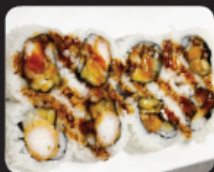
Shrimp Tempura Roll (8 pcs) $6.50