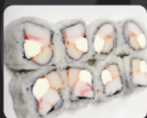
Crab Meat Cheese Roll (8 pcs) $6.25