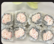
Crab Meat Roll $5.75