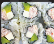
Hollywood Roll (8 pcs) $6.50