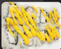
Spicy Roll $6.25