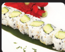
Avocado Roll (8 pcs) $5.75