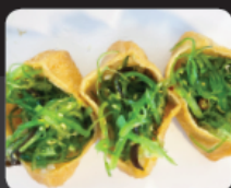
Tofu Skin Roll (5 pcs) $5.00