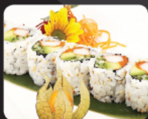
California Roll (8 pcs) $6.50