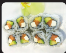
Salmon Roll (8 pcs) $6.75